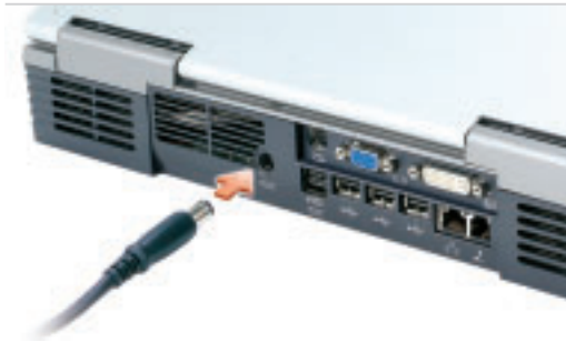
1 AC Adapter

Before you set up and operate your Dell™ computer, see the safety instructions in the Owner's Manual . Also, see your Owner's Manual for a complete list of features.