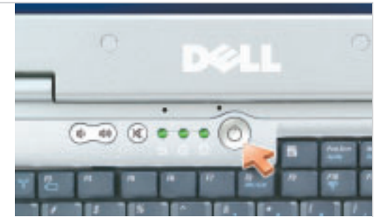
4 Power Button